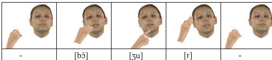
Figure 1: Chronogram for the word “Bonjour” pronounced and cued by our virtual speaker.

rameters for the head, face, arm and hand of a virtual cuer and an acoustic signal. The control, shape and appearance models of the virtual cuer (see Figure 1) have been determined using multiple multimodal recordings of one human cuer. The different experimental settings used to record our target cuer and capture its gestures and the complete text-to-Cued speech system are described in our JASA paper (Gibert, Bailly et al. 2005).